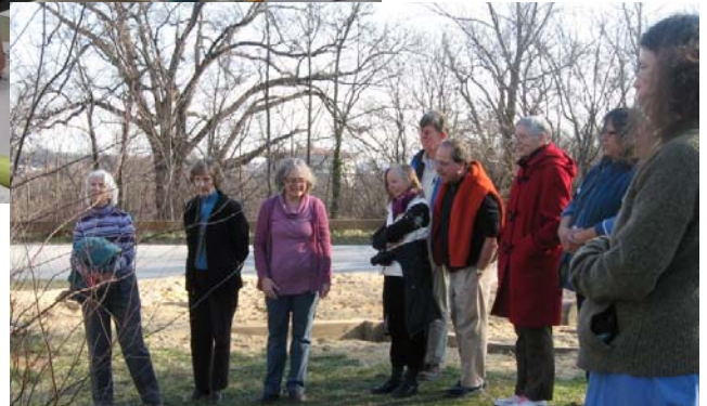
Workshop participants in an outdoor activity.